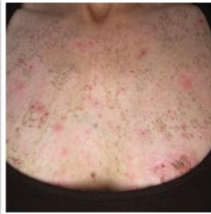
9 DAYS POST IPL LASER BURN. 2 DAYS ON RECOVERY