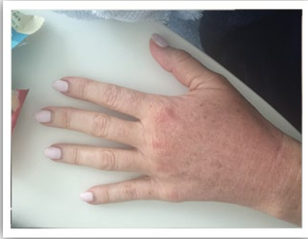
LEFT HAND - 1 DAY AFTER FRAXEL LASER TREATED WITH NEOGENESIS