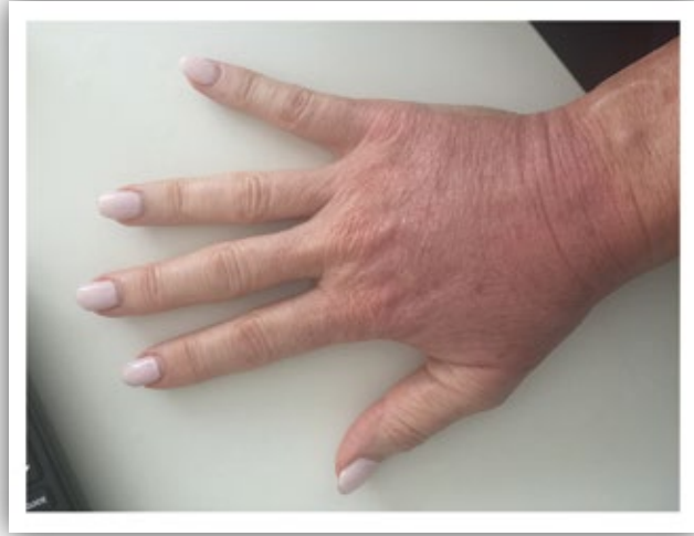
RIGHT HAND - 1 DAY AFTER FRAXEL LASER TREATED WITH ANOTHER LEADING PRODUCT

“I had Fraxel Laser done on my hands so I could compare the Recovery and Intensive Moisturizer (on my left hand) with another leading product used post laser, (on my right hand). The day after the procedure my right hand was inflamed, red and felt like I had a severe sunburn. My left hand had very little redness, almost no inflammation and most importantly, NO PAIN! By Day 2 my right hand still felt tender and slightly sunburnt but, my left hand felt fantastic!”