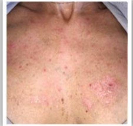
14 DAYS POST IPL LASER BURN. 6.5 DAYS ON RECOVERY

“I’m a licensed Pharmacist and work with and used other skin care products in the past but my experience has left me in shock after personally seeing how NeoGenesis Recovery worked on my IPL Laser Burns. I honestly have never seen anything like it, worked so fast!”